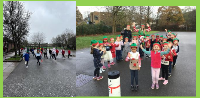
Our Elf run was an 'elf extravaganza' this morning.