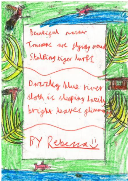
By Rebecca B